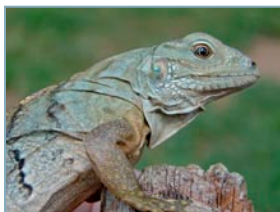
“Quincy” - March 2004

In either case, be sure to indicate clearly that you wish your contribution to assist the Blue Iguana Recovery Program.