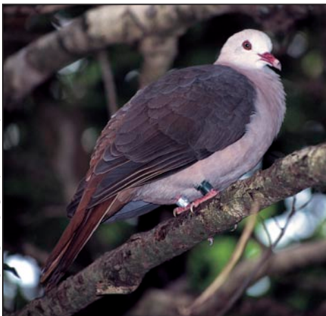
Pink Pigeon